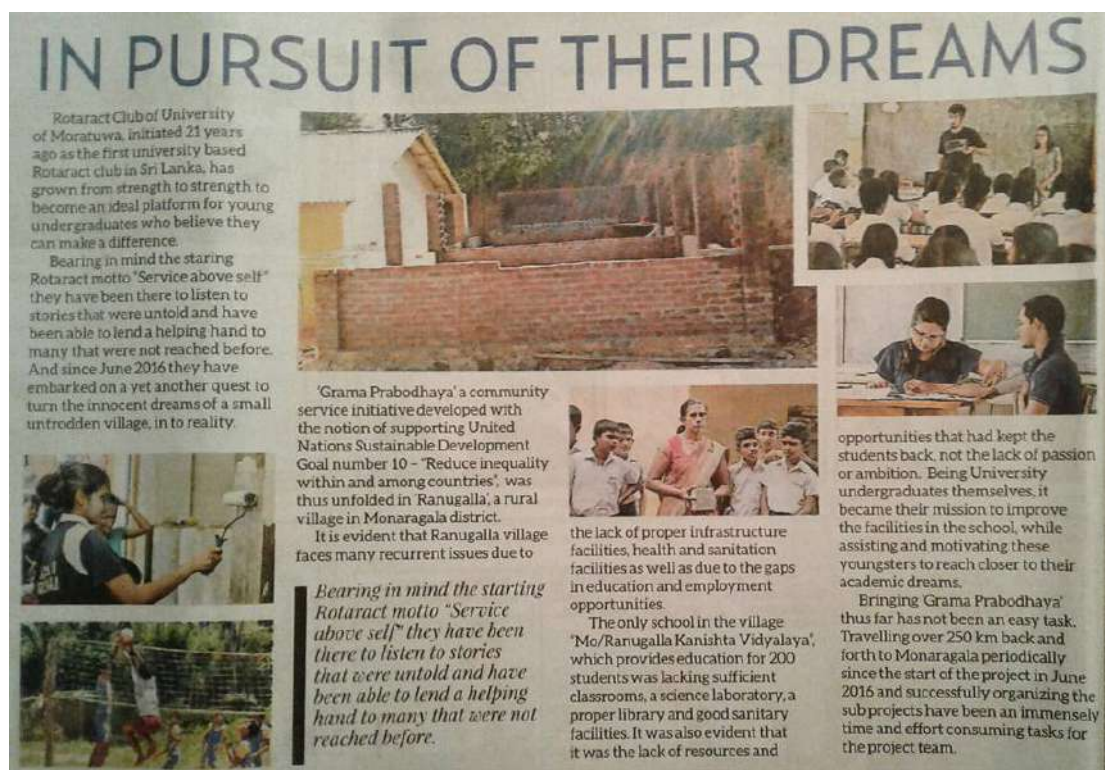
Life Supplement of Daily Mirror, Friday, 5th of May 2017 page C16.